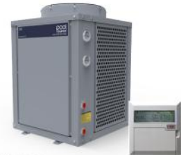
PPT-060MSVS PAC Pooltemper High temp With Wired Digital Controller